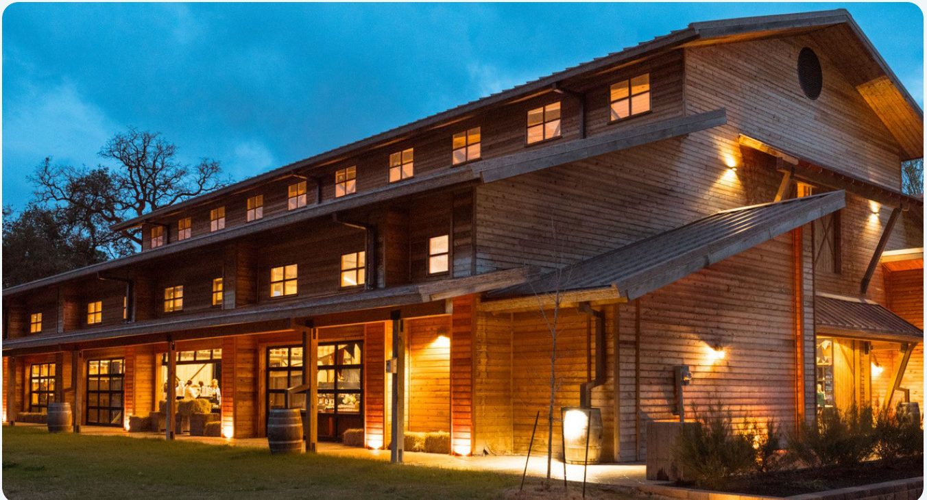
Western Academy Gymnasium