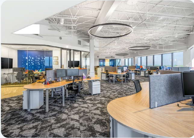
Heights Venture Office