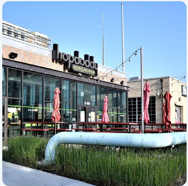
hopdoddy Burger Bar